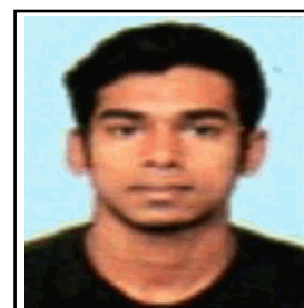
Md. Shoaib Akhtar