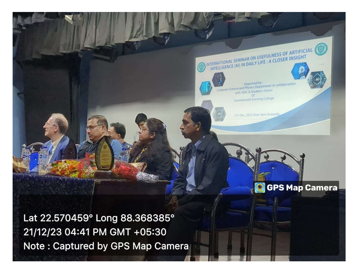
Inauguration and Felicitation of the guests