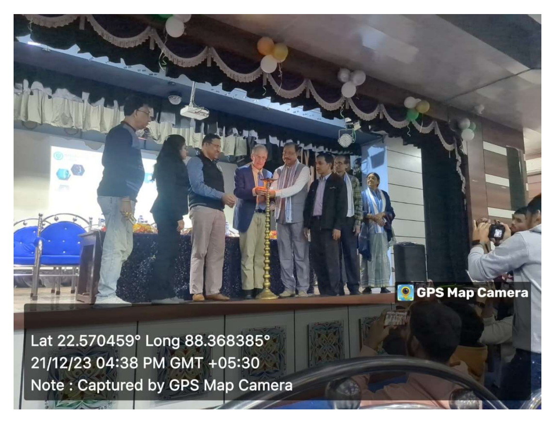
Lightning of the Lamp